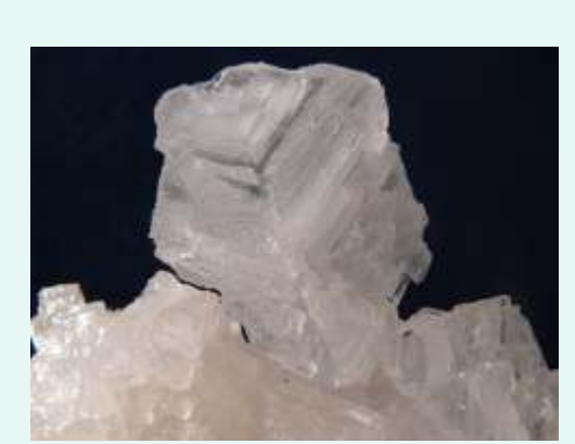
Rock salt (halite) crystal

Natural salt pans are flat expanses of ground covered with salt and other minerals, usually shining white under the sun. They are found in dry climates. In Namibia salt pans occur along the coast, for example at Cape Cross, as well as further inland (Etosha Pan).